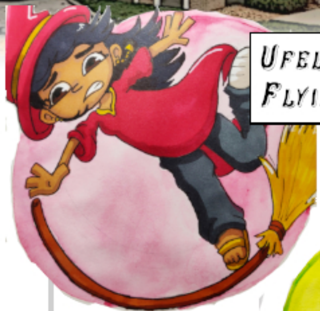
UFELA BRISKFALL (ANY) FLYING TA