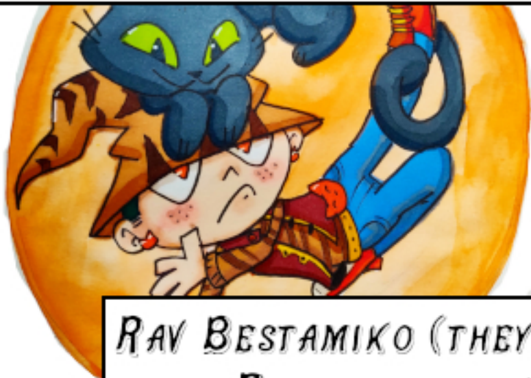
RAV BESTAMIKO (THEY/THEM), FAMILIAR TRAINING TA