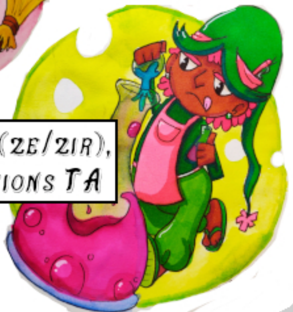
BALIN DUTHAHÁ (ZE/ZIR), POTIONS TA